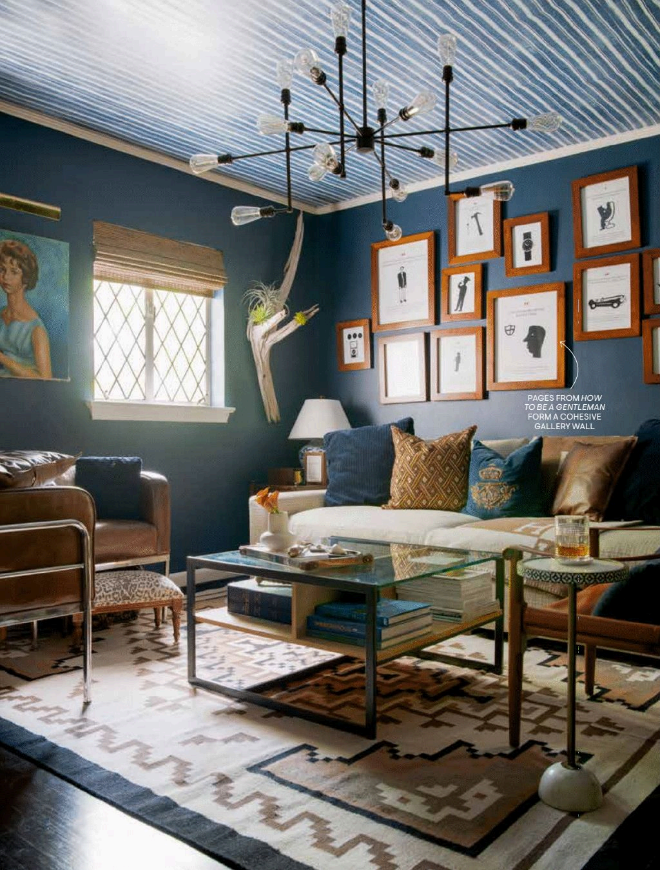
PAGES FROM HOW TO BE A GENTLEMAN FORM A COHESIVE GALLERY WALL